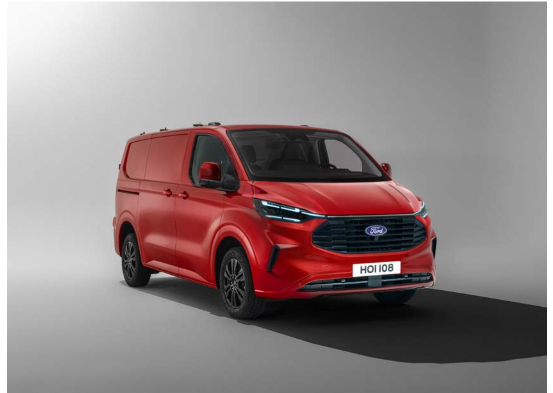
All-New Transit Custom