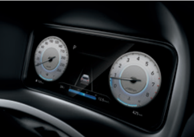
10.25" Supervision cluster