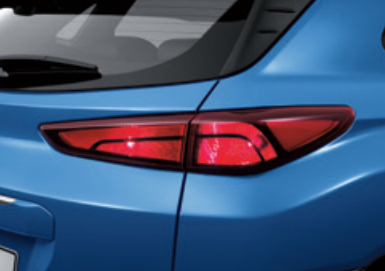
Rear combination lamps (bulb type)