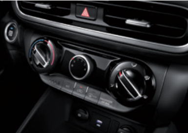
Manual air conditioning system