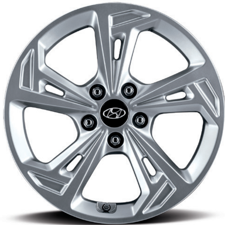
Dynamic new range of alloy wheels