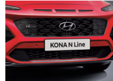
N Line specific front bumper with grille