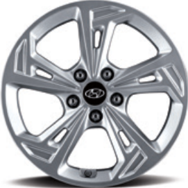
17" Alloy wheel *Available on Executive Models