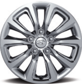
16" Steel wheel & Wheel cover