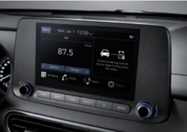
8" Touch screen display