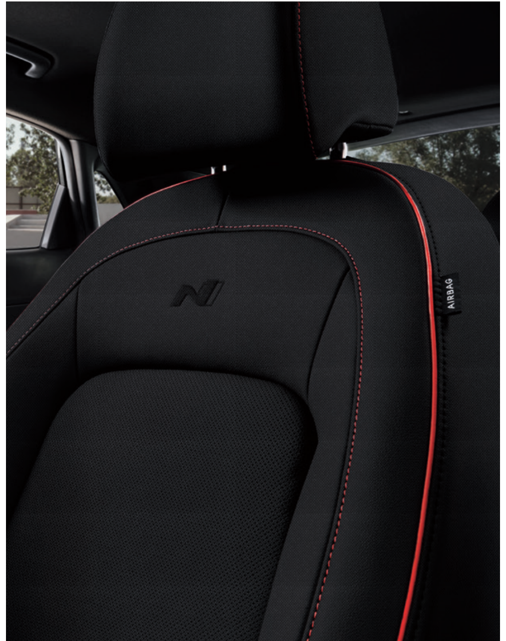
N Line seats with red accent stitching