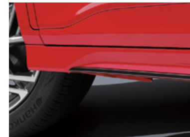
N Line specific side sill moulding