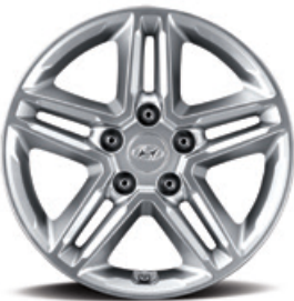
16" Alloy wheel *Available on Comfort Plus Models