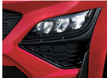
N Line specific LED headlamps