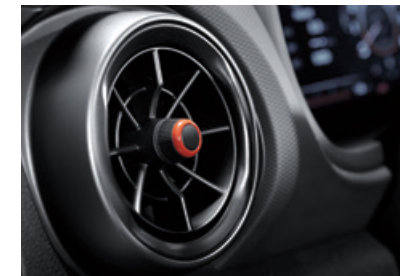
N Line red-color accent AC vents