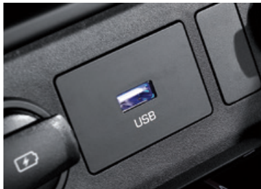
Front USB port with tray