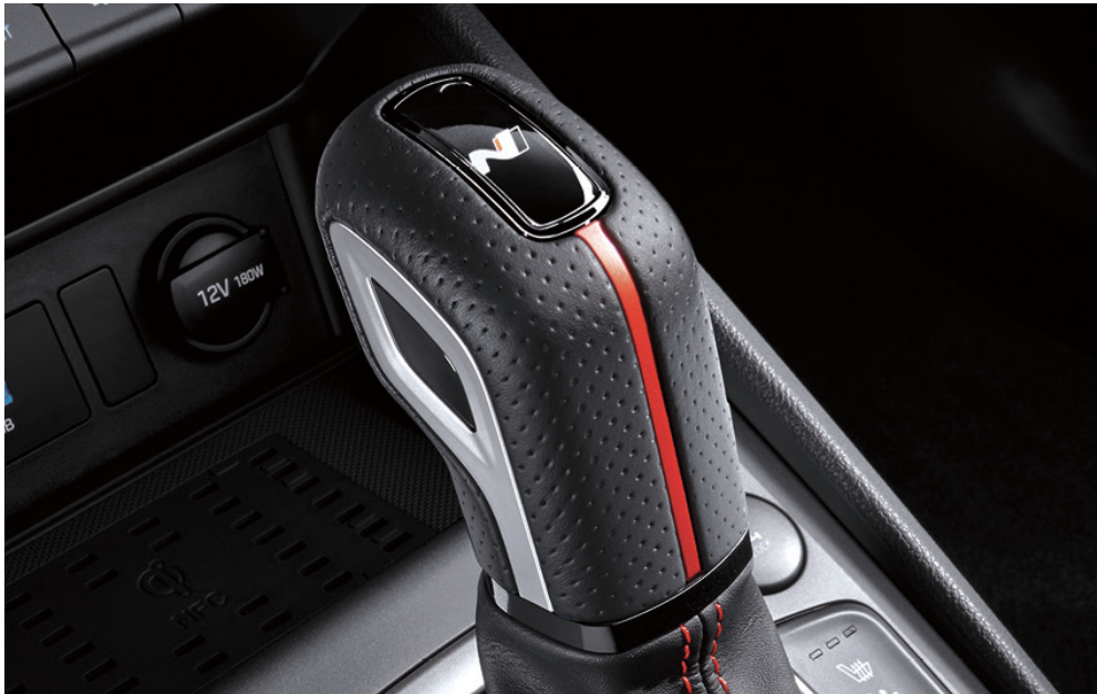
N Line steering wheel N Line gear shifter knob