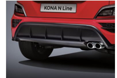
N Line specific rear bumper with twin tip muffler