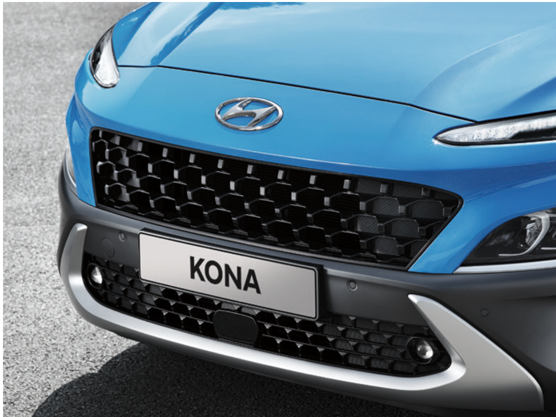
Newly sculpted front end projects a sporty, muscular look