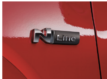
N Line specific side emblem