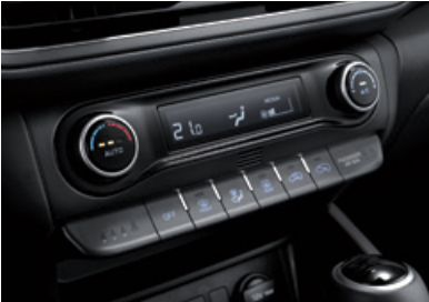
Full auto air conditioning system *Available on Executive Models Upwards